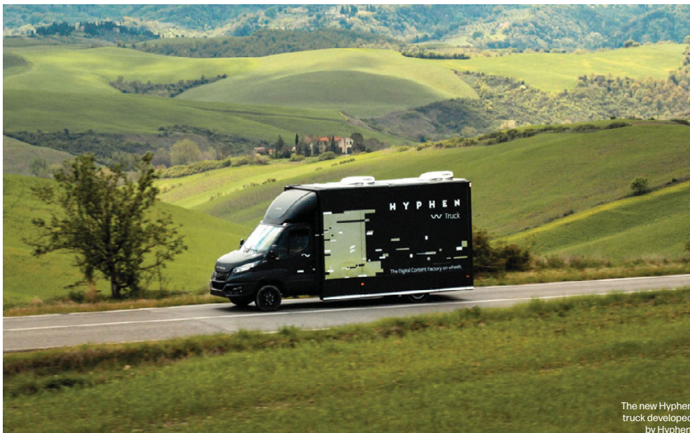
The new Hyphen truck developed by Hyphen.