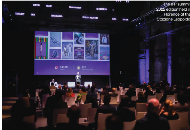
The e-P summit 2022 edition held in Florence at the Stazione Leopolda.

In the last year, the metaverse has become a great addition for fashion brands to show their collections, interact with customers and propose exclusive collaborations only available in the virtual world. For example, Gucci created a Gucci Garden in the Roblox gaming platform. In January, Nike brought the digital Nikeland experience to its New York City store on Fifth Avenue. Estée Lauder designed a metaverse space on Decentraland in which users were able to receive wearable NFTs from the Advanced Night Repair's product.